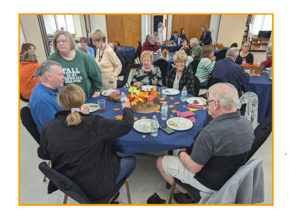
Thanksgiving Potluck Lunch